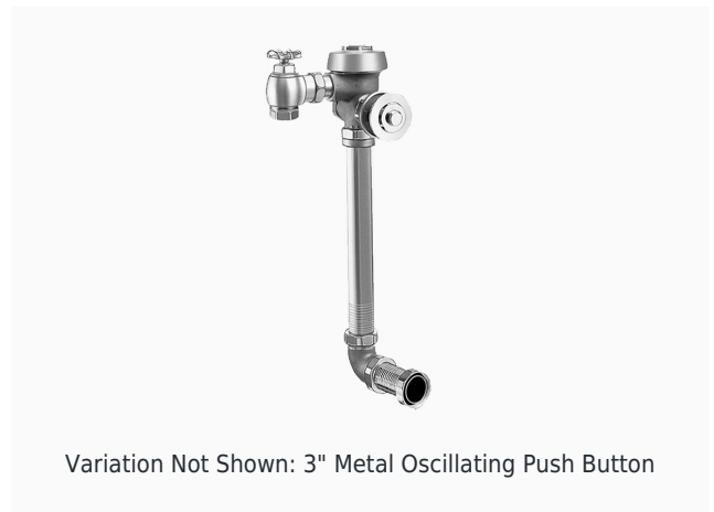
Variation Not Shown: 3" Metal Oscillating Push Button